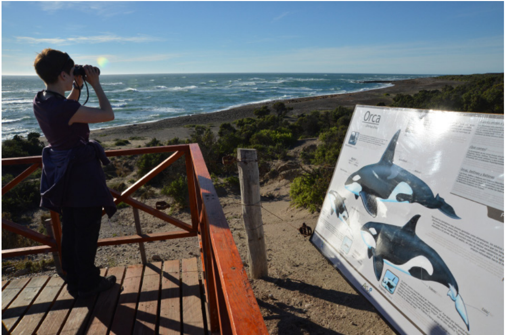
Figure 8. A visitor respectfully watching for orca at the designated wildlife area, the 'Mirador', Punta Norte. From here, although orca are often the species most sought after, elephant seals, sea lions, a multitude of bird species, terrestrial animals such as armadillos and foxes, can all be seen.

The long-term implication of constantly disturbing the sea lions and elephant seals was of course that the colonies would be abandoned. If there was no prey, the predators would stop coming. The cascade effect would include animals that might not even be considered by the tourists that were interfering with the ecosystem, such as the scavengers who feed on the discards from orca; not only sea and terrestrial birds (Quintana et al., 2006; Pavés et al., 2008; Formos et al., 2019), but also sea creatures such as starfish, amphipods and other benthic scavengers – e.g., see Smith et al., (2015); Quaggitoo et al., (2017). It was therefore abundantly clear that that something needed to be done to curb these disturbances.