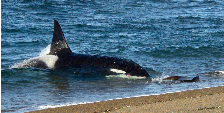
Figure 6. The iconic adult male orca known as Mel (catalogue # PTN-001) was first recorded at Punta Norte in 1975 and has featured in all the research projects since then. We photographed him from the inception of our research in 2004. He was last documented in 2011 and only one adult male orca has been recorded intentionally stranding to hunt since then.