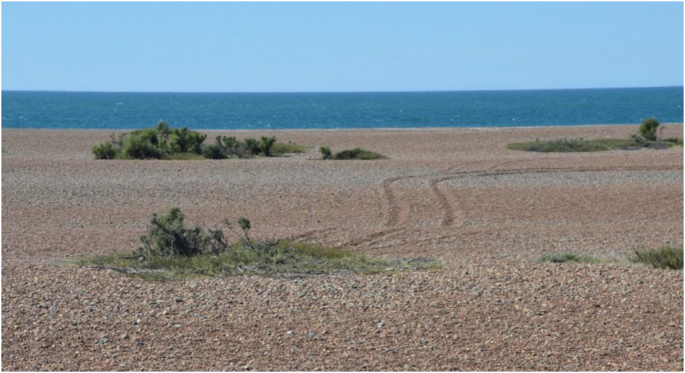
Figure 9. Vehicle tracks on the pebble platforms (uplifted previous beaches). The vehicles crush slow-growing specialist vegetation as well as potentially kill ground-nesting birds and/or crushing their eggs. Their tracks are visible years later.