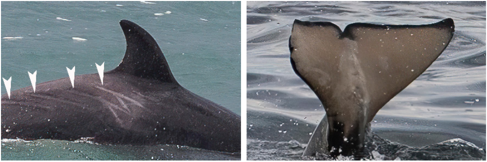
Figure 7. A young calf, offspring of Maga (catalogue # PTN-033 and born a year before these photographs were taken), was run over by a boat. Although it has survived, the long-term impacts from such an injury could be extreme. The propeller cut into the calf at least four times (white arrows, left), and sliced off the end of the calf's left tail fluke (right).

There are no boat-based whale-watching tours to see the orca off Punta Norte, so the injury the calf sustained must have occurred elsewhere. Boats of any kind are severely restricted around the UNESCO Site, with the exception of licensed tour operators departing from Puerto Pirámides, who focus on watching Southern right whales during the breeding season (and other wildlife outside of this time and therefore they only occasionally encounter the orca). These operators have a 'Code of Conduct' and regulations with speed restrictions and the maximum number of boats near the whales at any one time (Provincial Laws No 2381/84 & No 2618/85).