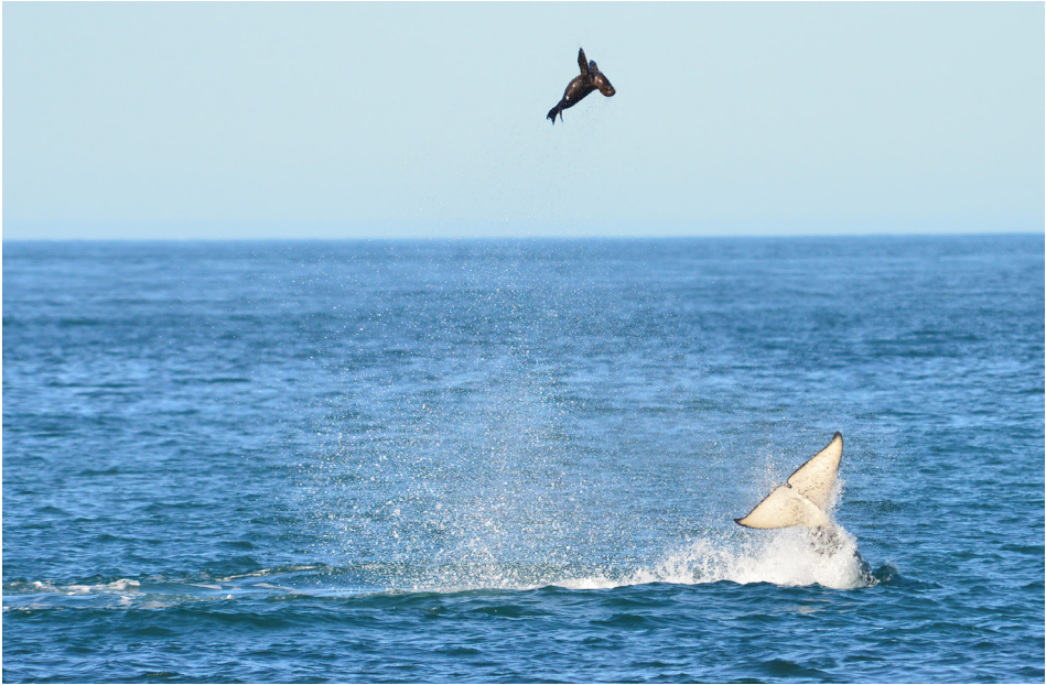
Figure 11. An orca hits a Southern sea lion pup into the air. The likelihood of the pup surviving this is minimal as they typically suffer broken ribs and internal organ damage. Some make it back ashore, only to die.