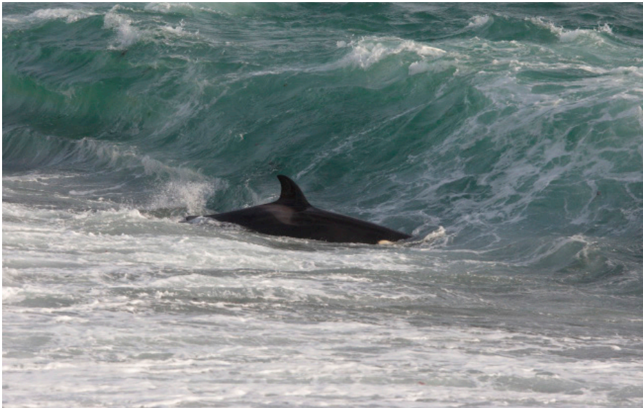
Figure 4. At only four years old, Shotel (catalogue # PTN-026), remains the youngest orca we have documented who intentionally strands. Although born in 2014, as yet we don't know if Shotel is a male or a female, but we do know his/her mother is Llen (catalogue # PTN-010), who is a proficient hunter. Practicing stranding, not just in calm waters, but also in larger waves which 'dump' onshore, helps the animals become successful hunters.