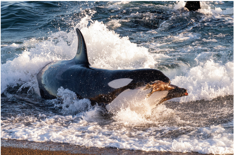
Figure 12. Sheuen, a female orca (catalogue # PTN-021), begins to turn seaward after capturing a sea lion pup at Punta Norte. Although the population has been growing slowly, it is comprised of an incredibly small number of <20 core individuals in 2020, making this ecotype one of the rarest in the world.