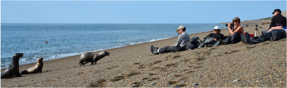
Figure 10. Three sea lions approach the PNOR research team with accompanying ecotourism guests. The pinnipeds have become habituated to the team and will at times fall asleep in the middle of us, demonstrating how comfortable they now are with the researchers.

It may also be only a coincidence, but there has been a rise in the number of orca who intentionally strand since the fence was installed. A potential increase in prey for the Punta Norte orca may be linked to this current population growth as pregnancy success was directly linked to availability of prey for the endangered Southern Resident ecotype (Wasser et al., 2017).