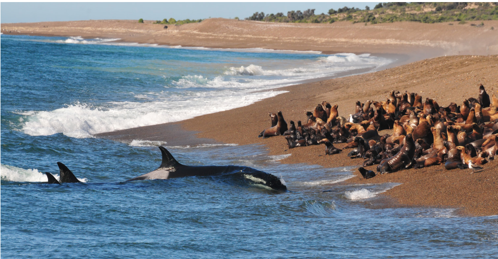
Figure 2. An adult female known as Maga (catalogue # PTN-004) is accompanied by her daughters Valen (PTN-009) (middle) and Mica (PTN-008) (left), as she intentionally strands to capture a South American sea lion pup, at Estancia La Ernestina, Punta Norte, Península Valdés.